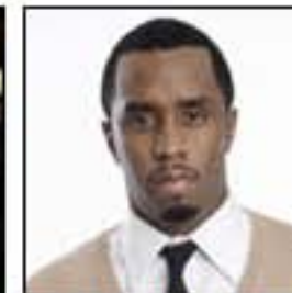
The Leader of the Brand