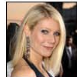
L.A. premiere of 'Iron Man'